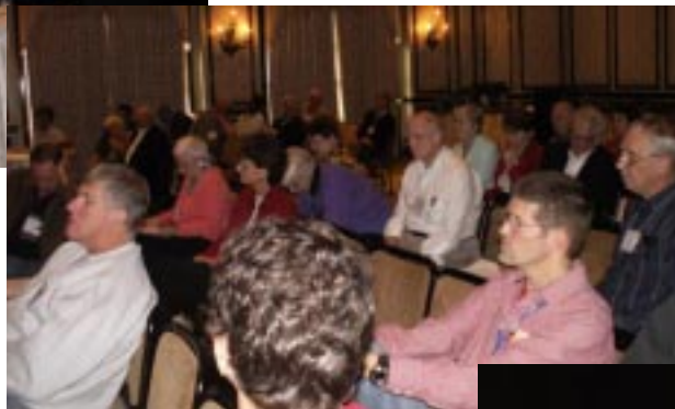
Having fun at the Eastern Regional meeting in Dallas